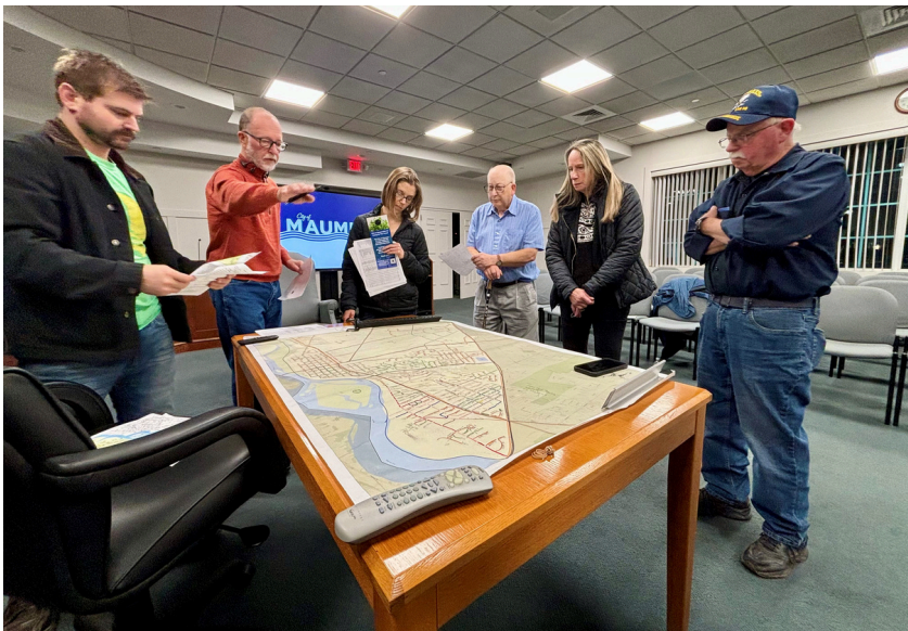
Members of the Environmental & Tree Advisory Commission work to develop a Tree Design Plan.

https://maumee.org/environmental-sustainability/tree-planting-initiative/