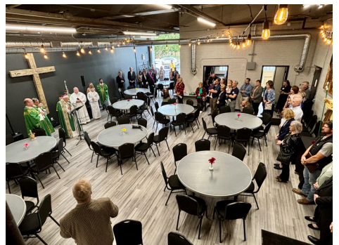
The clergy and staff held a blessing ceremony and reception at the Parish Ministry Center, located at the corner of Allen and Wayne Streets in Maumee.