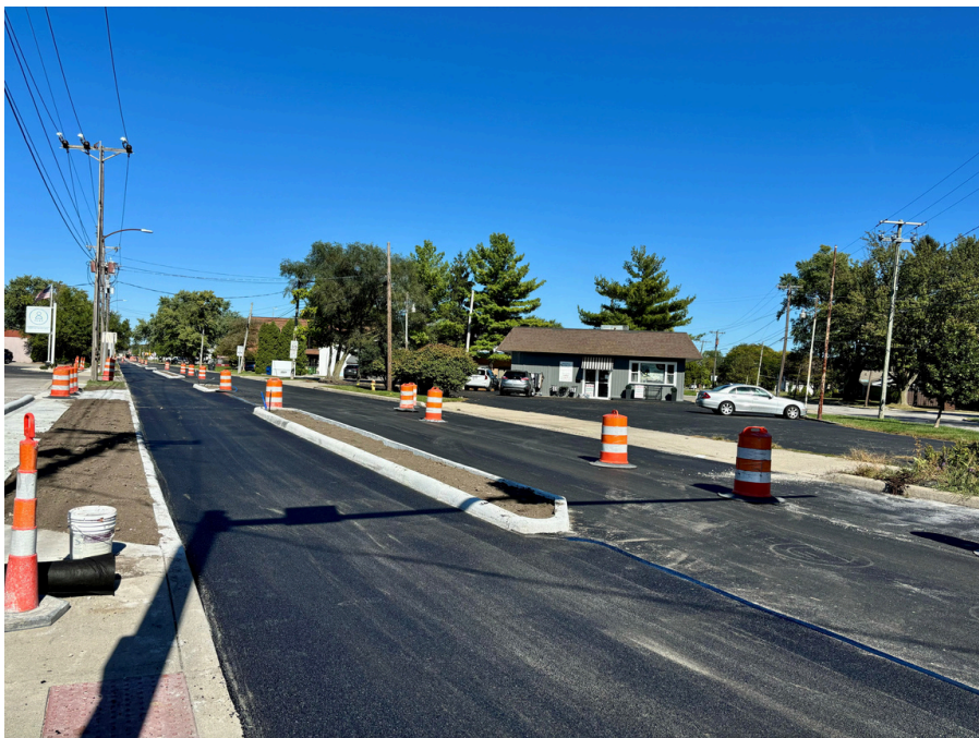
Work on Detroit Avenue should be wrapped up in late October, which will add greater safety routes for pedestrians and cyclists.

The $615,024 project is being partially funded by the federal government in the form of a Surface Transportation Block Grant (STBG) in the amount of $365,520. The grant funding will be administered through the Ohio Department of Transportation (ODOT) for this project.