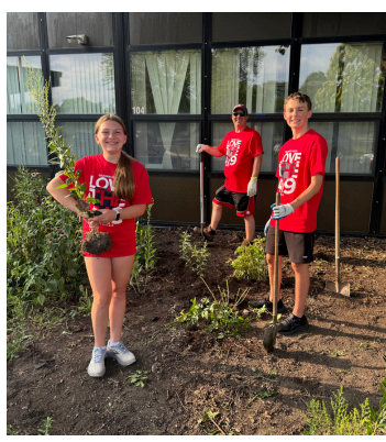
Pictured are Calvary Church Serve Week volunteers