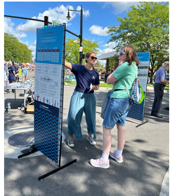
The staff from Yard & Co., joined with the Maumee Master Plan Committee to discuss the survey with attendees at this year's Maumee Summer Fair.

Maumee Momentum | Yard & Company ( mysocialpinpoint.com )