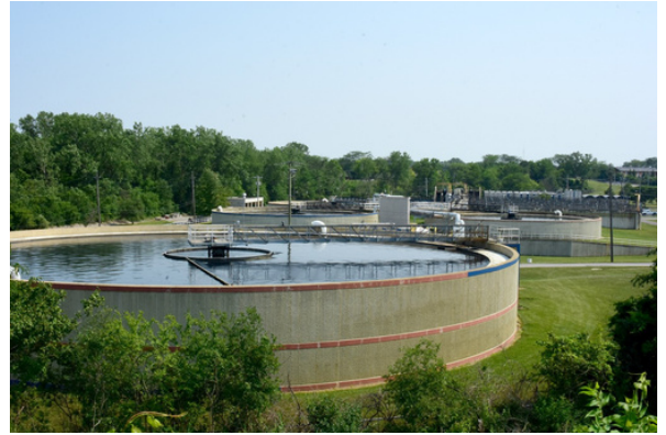
Maumee pumps sanitary sewer water for treatment to the Lucas County Water Resource Recovery Facility which is located on River Road near The Shops at Fallen Timbers

For information, please visit https://maumee.org/building-and-inspection/real-property-conveyance-ordinance-20-2024/